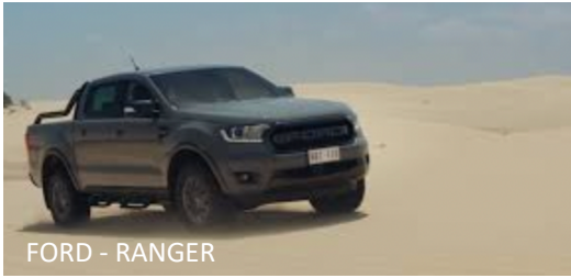
FORD - RANGER