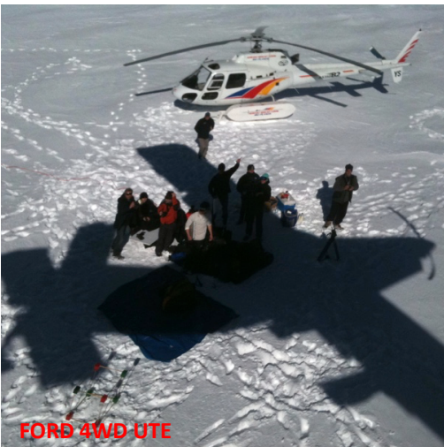
FORD 4WD UTE