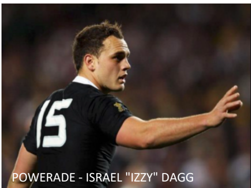
POWERADE - ISRAEL "IZZY" DAGG