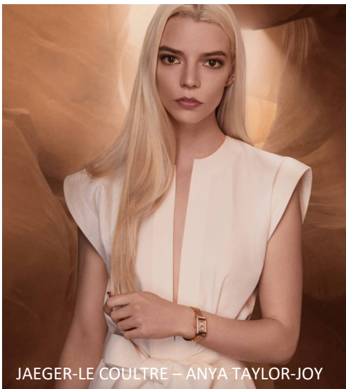
JAEGER-LE COULTRE – ANYA TAYLOR-JOY